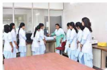
Pharmaceutics PG Lab