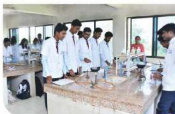
Pharmachemistry Lab (UG)