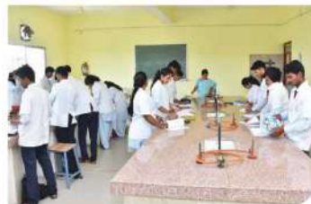
Pharmaceutics Lab (UG)