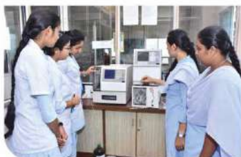
Central Instrumentation Area (HPLC Section)