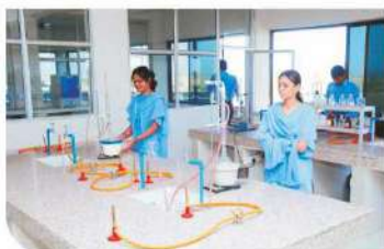
Quality Assurance Research Lab