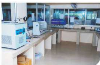
Pharmacology Research Lab