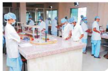
Pharmachemistry Lab-1 (PG)